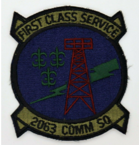
2063 Communications Squadron patch